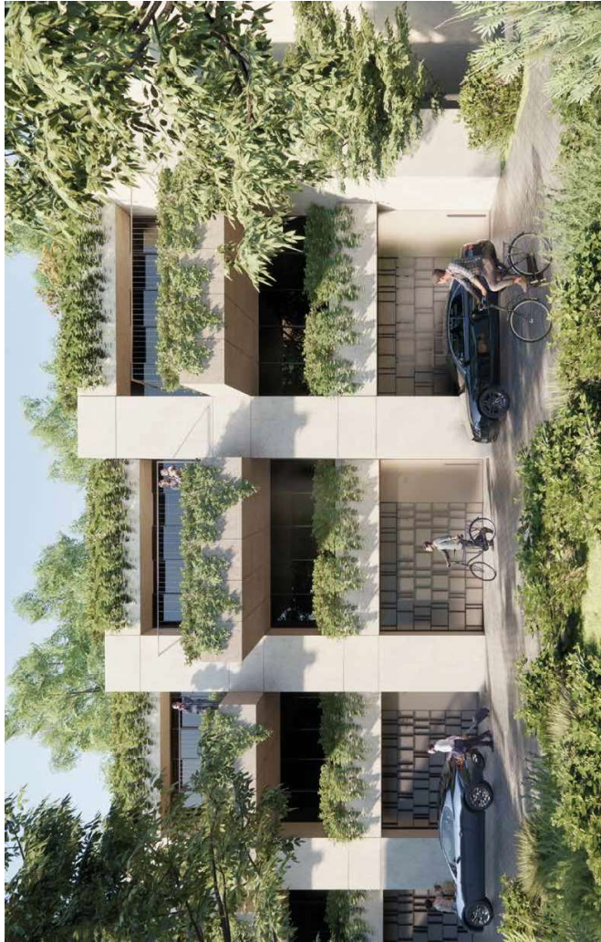
The Bay Plot numbers 1, 2, 3, 4, 19, 20, 21, 22, 23, 24, 25, 26, 27, 28, 29, 30 & 31

Choice of 17 high specification townhouses Private roof terrace with the option of a jacuzzi Versatile basement option 1 internal & 1 external car park space